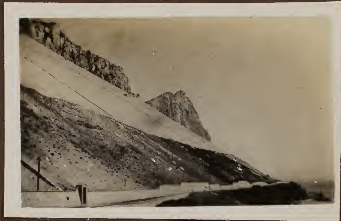
Catchment NE Area